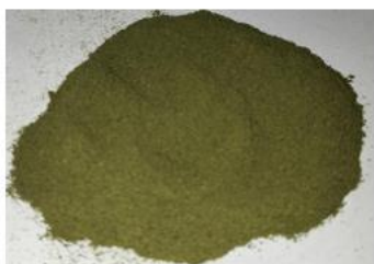
Figure 1. Simplicia of Leaf Phaseolus vulgaris L.

Organoleptic evaluation is one of the specific quality parameters used to characterize herbal raw materials through sensory observation, including appearance, color, odor, and taste (Ministry of Health of the Republic of Indonesia, 2000). The organoleptic examination of the leaf simplicia of Phaseolus vulgaris L. revealed that the material was in powder form, green in color, possessed a characteristic odor, and exhibited a bland or tasteless flavor (Herman H et al., 2022).